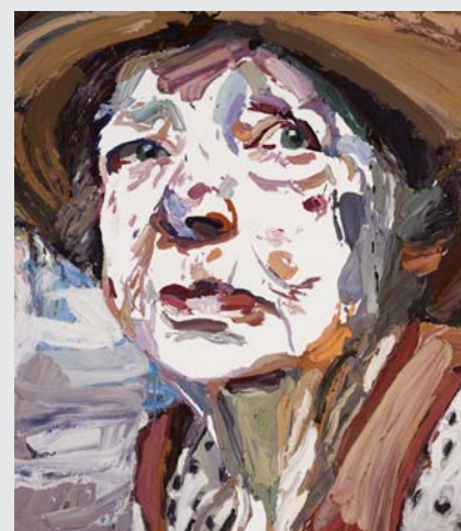
2011 Archibald winner Ben Quilty Margaret Olley

Eagerly anticipated by artists and audiences alike, this annual event never ceases to create lively debate amongst the arts community and wider public. Each year, the trustees of the Art Gallery of NSW judge the Archibald and Wynne prizes, and invite an artist to judge the Sulman Prize. One of Australia's oldest and most prestigious art prizes, the Archibald is awarded to the best portrait painting, preferentially of some man or woman distinguished in art, letters, science or politics. The Wynne is awarded to the best landscape painting of Australian scenery or figure sculpture, while the Sulman is given to the best subject painting, genre painting or mural project in oil, acrylic, watercolour or mixed media.