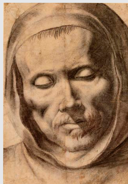
Francisco de Zurbarán Head of a monk 1635–55, black chalk and grey wash with traces of pen and ink, 27.7 x 19.6 cm.

This exhibition is presented by the British Museum in collaboration with the Art Gallery of New South Wales.