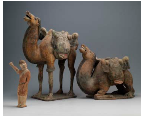
Groom and Camels , Northern Qi dynasty low relief 550–577, terracotta. Excavated from the tomb of Lou Rui, Wanggua village, Jinyuan, Taiyuan, Shanxi Province, 1981 Shanxi Provincial Museum

In 1999 an extraordinary white marble sarcophagus, unlike any previous discovery, was excavated in Taiyuan, the capital of central China's Shanxi province. It belonged to Yu Hong and his wife, who had been interred in 592 and 598 CE respectively. This magnificent object in many ways exemplifies the transcultural nature of life along the famous Silk Road, with its multiethnic mix of traders, pilgrims, monks and soldiers. From afar, it looks like the model of a typical Chinese building, but closer inspection reveals detailed scenes of hunting, entertaining and religious worship, carved or painted on the interior and exterior. While the sarcophagus is the centrepiece, this exhibition also includes more than 20 objects from the tomb or from burials of the same period in the same province.