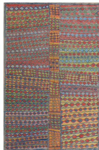
Gumuk Gumana River at Gangan 1947, crayon on paper, 115 x 74 cm. Berndt Museum of Anthropology