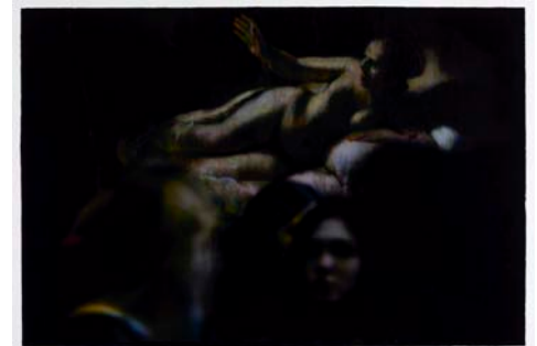
Bill Henson Untitled 2009–10, archival inkjet pigment print. Purchased with funds provided by the Art Gallery Society of NSW 2011

Bill Henson is one of Australia's leading contemporary artists. A master of the use of light and dark in the tradition of the great European masters, he has worked in the photographic medium for over three decades. This exhibition presents a selection of 12 photographs from the Gallery's collection. It reveals nuanced changes in colour and motif in the pictures over a 20-year period as he continues to work intensively on large-scale figure studies and 'landscapes'. This is the first time this group of photographs by Henson has been shown together at the Art Gallery of NSW.