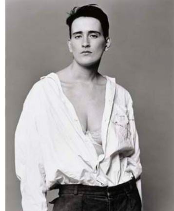
Bettina Rheims Martine 1989, gelatin silver photograph from the series Modern Lovers 1990. Gift of Edron Pty Ltd 1996 through the auspices of Alistair McAlpine

The Art Gallery of NSW has over 20 important photographs from an exemplary period in Helmut Newton's career, the years 1972-83. Newton had the ability to shock his audience by making explicit the relationship between body, clothes, environment and voyeurism. As German art historian Klaus Honnef commented in 1988, 'The totally artificial atmosphere of traditional fashion photography is missing in Newton's work, and we can begin to sense a latent imaginative realm of fantasies, dreams and nightmares'. The Gallery also holds Bettina Rheims' celebrated series Modern Lovers 1990, in which she subverts fashionable ideals of beauty by portraying the androgyny of young men and women.