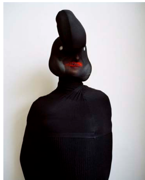
Polly Borland Untitled XXXII from Smudge 2010, chromogenic print, 76 x 65 cm.

What is love? This exhibition of works by 11 contemporary artists explores the emotions of love, the pleasures of the flesh, and the wistful nostalgia of recollection. From playfully dressed-up bodies replete with sexual suggestion to a disintegrating sculpture of a stargazing young man and to collages evoking the memories and innocence of childhood, We used to talk about love considers the varied terrain of love's language – joy, elation, longing, loss, melancholia and memory. For the first time since opening to the public in 1988, the now-named Belgiorno-Nettis galleries will be reconfigured to take the viewer on a spatial and emotional journey through love's language, from beginning to end. The exhibition features work by Polly Borland (USA/Aus), Eliza Hutchison (Vic), Paul Knight (UK/Aus), Angelica Mesiti (France/Aus), David Noonan (UK/Aus), David Rosetzky (Vic), Darren Sylvester (Vic), Tim Silver (NSW), Glenn Sloggett (Vic), Grant Stevens (QLD) and Justene Williams (NSW).