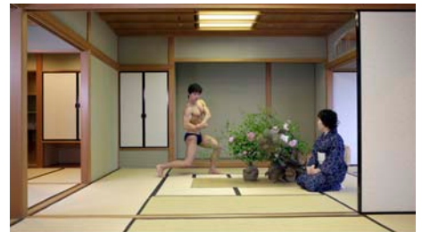
Alex Kershaw Muscles and pears 2011 Production still from the work Fantasticology Tokyo: faults, flesh, flowers , HD video

Alex Kershaw uses video as a tool for mediating intercultural exchange, through a process that incorporates performative, cinematic and 'ethnographic' approaches. Kershaw's new project Fantasticology Tokyo was developed in collaboration with four masters of Ikebana, the Japanese art of flower arrangement. The multi-channel video installation reworks vestiges of this ancient tradition through a series of orchestrated twists of context and materials that challenge and reinvent established roles and meanings.