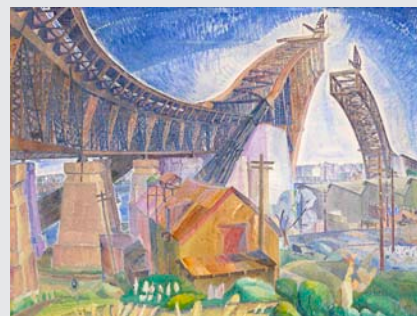
Grace Cossington Smith The bridge in curve 1930, tempera on cardboard, 83.6 x 111.8 cm, National Gallery of Victoria, Melbourne. Presented by the National Gallery Society of Victoria, 1967 (1765-5) © Estate of Grace Cossington Smith