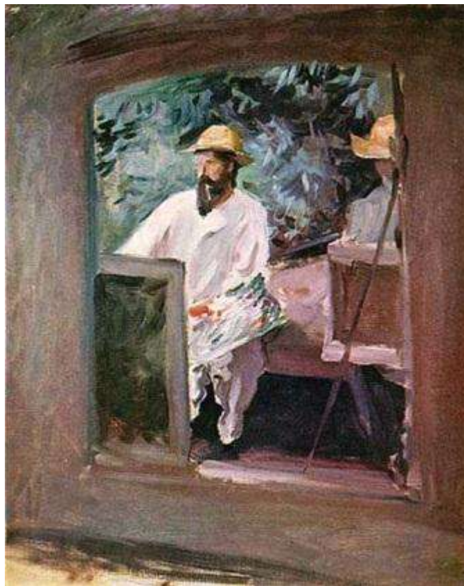
John Singer Sargent, Oil sketch of Claude Monet and his step-daughter, Blanche painting on Monet's boat-studio , c. 1887. Private collection