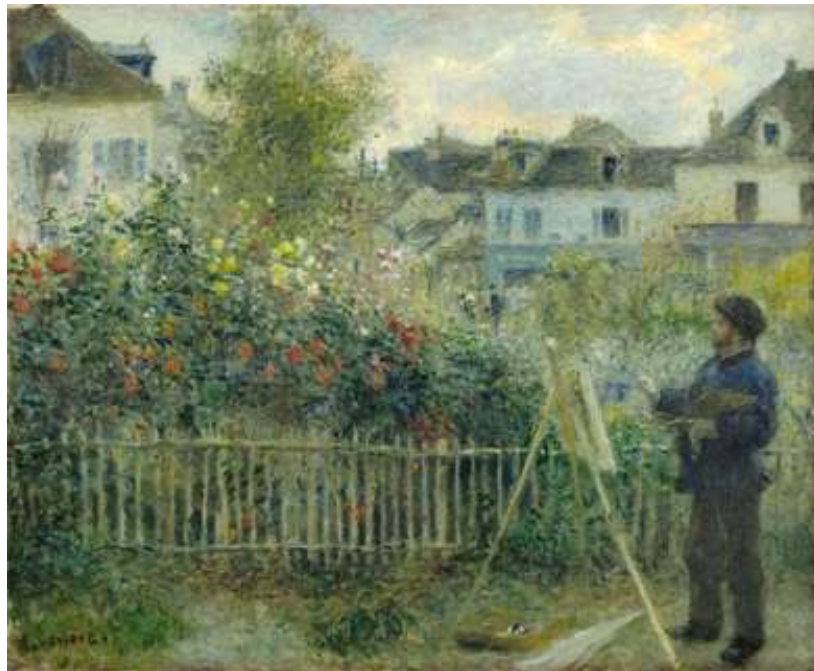
Pierre-Auguste Renoir, Monet painting in his garden at Argenteuil , 1873, Wadsworth Athenaeum, Hartford Conn.