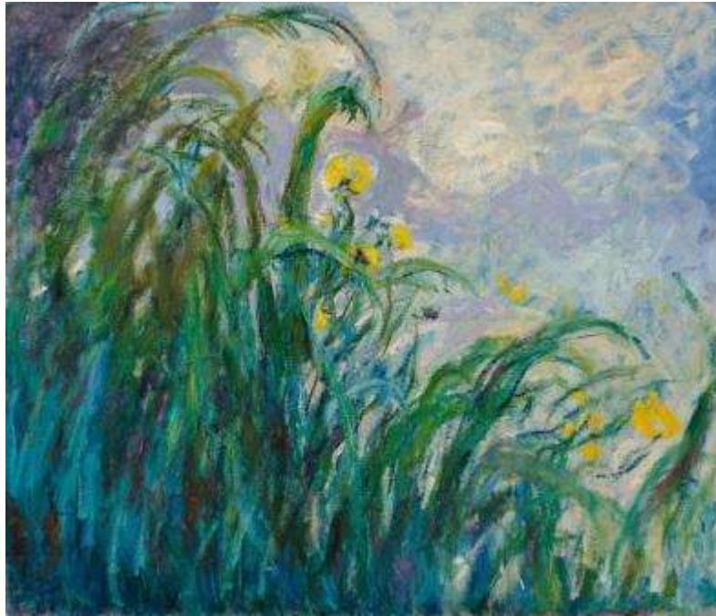
Claude Monet, Yellow Irises (Iris jaunes) (1924–25) Musée Marmottan Monet, Paris