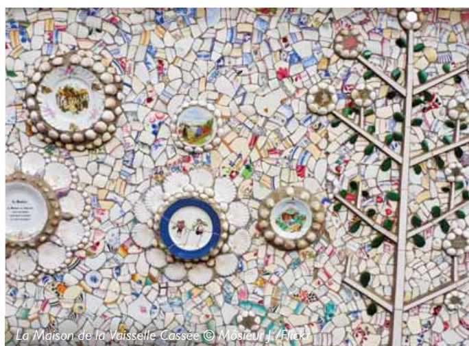
La Maison de la Vaisselle Cassée

You can find the full terms & conditions at www.renaissance-tours.com.au/booking-conditions or we would be happy to post you a copy on request.