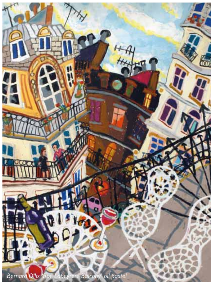
Bernard Ollis 'Rue Lapeyrière Balcony' oil pastel