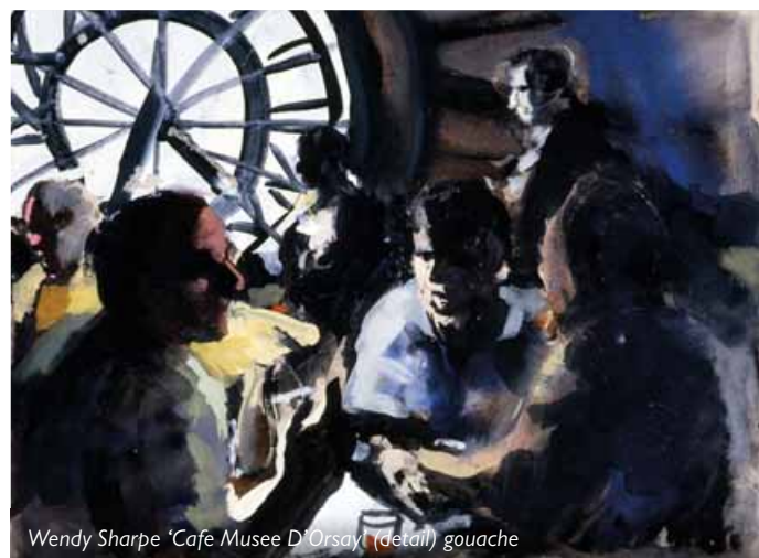
Wendy Sharpe 'Cafe Musee D'Orsay' (detail) gouache