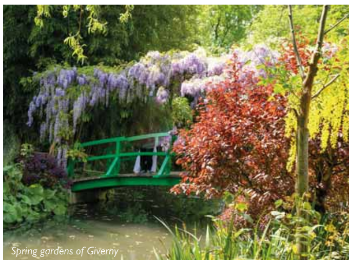
Spring gardens of Giverny

NB. Hotels of a similar standard may be substituted