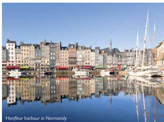
Honfleur harbour in Normandy