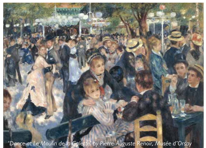
'Dance at Le Moulin de la Galette' by Pierre-Auguste Renoir, Musée d'Orsay

Afternoon at leisure to further explore Rouen. Dinner at a local restaurant. B D