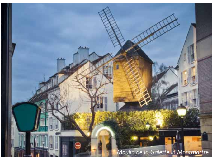
Moulin de la Galette in Montmartre