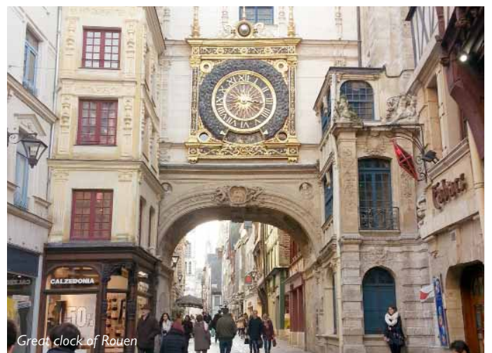
Great clock of Rouen