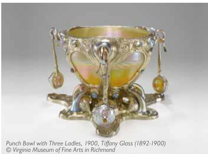
Punch Bowl with Three Ladies, 1900, Tiffany Glass (1892-1900)

This evening, subject to performance schedule, enjoy a possible concert by the Pittsburgh Symphony Orchestra at the Symphony Centre or Pittsburgh Opera (not included in tour price, additional cost applies). B