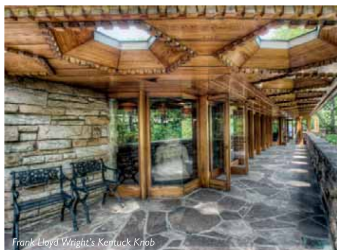
Frank Lloyd Wright's Kentuck Knob