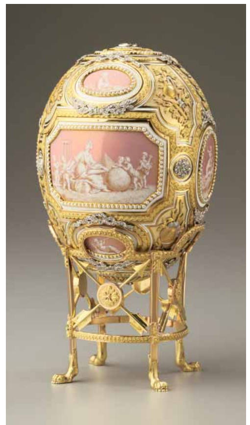
Catherine the Great Easter Egg (Fabergé, 1914) at Hillwood Estate, Museum, and Gardens

Enjoy a day at leisure to explore Washington on your own. Our suggestion is to visit the extraordinary Smithsonian Institution, the world-renowned museum and research complex consisting of 15 separate museums and the National Zoo. The Smithsonian Institution is sometimes referred to as 'America's treasure chest' because of the diverse artefacts it houses. Whether you're interested in American history or Asian art, giant pandas or stamp collecting, there's a Smithsonian museum for you. Or, join Ron for a day trip by train to Philadelphia to visit the new Barnes Foundation (not included in tour price; depending on numbers interested, a coach may be organised). B