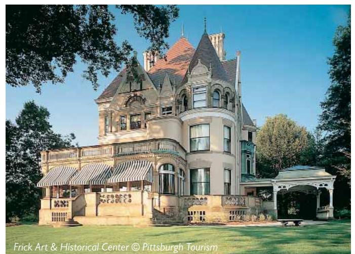
Frick Art & Historical Center