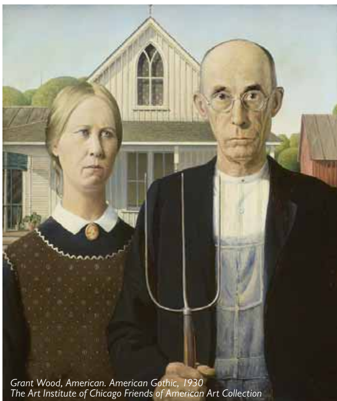
Grant Wood, American. American Gothic, 1930 The Art Institute of Chicago Friends of American Art Collection