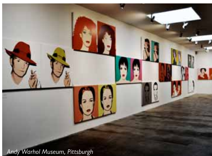
Andy Warhol Museum, Pittsburgh