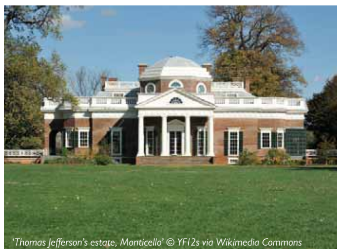
'Thomas Jefferson's estate, Monticello'