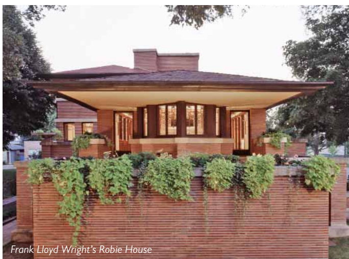
Frank Lloyd Wright's Robie House

Detailed tour information available early 2016.