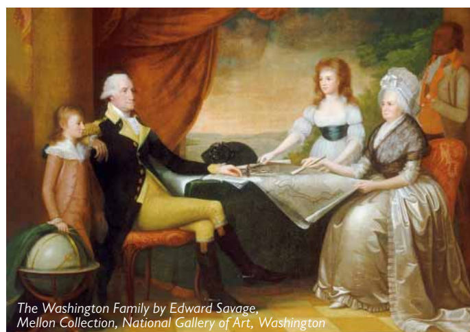
The Washington Family by Edward Savage, Mellon Collection, National Gallery of Art, Washington

Continue with a visit to the Kreeger Museum. Designed by renowned architect Philip Johnson, the Kreeger Museum houses 19th and 20th century paintings with works by Monet, Picasso, Renoir, Cezanne, Chagall, Miro, and Stella. Also included in the permanent collection are works of prominent Washington artists and outstanding examples of traditional African and Asian art. B