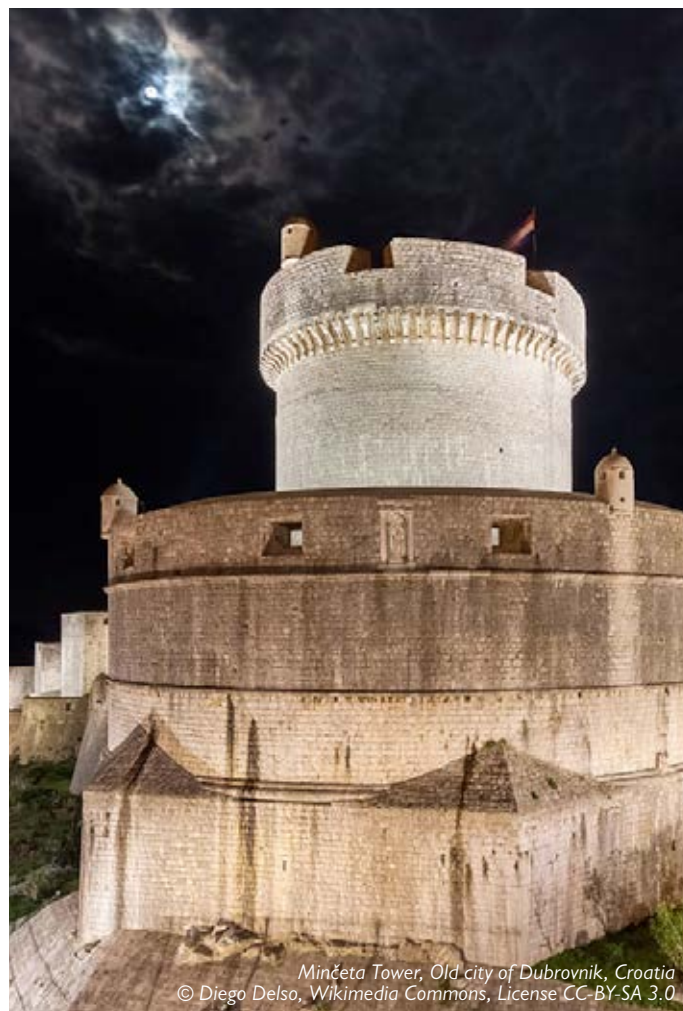
Minčeta Tower, Old city of Dubrovnik, Croatia

Arrival in Australia early morning Wednesday 08 June. B