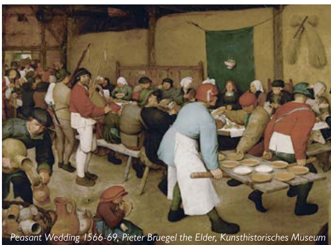
Peasant Wedding 1566-69, Pieter Bruegel the Elder, Kunsthistorisches Museum

Remainder of the afternoon is at leisure to relax and enjoy more of this delightful city, perhaps by visiting the Museum of Fine Arts. B L