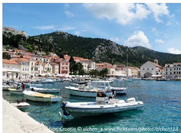
Hvar, Croatia

Return to Dubrovnik for hotel check-in and dinner. B D