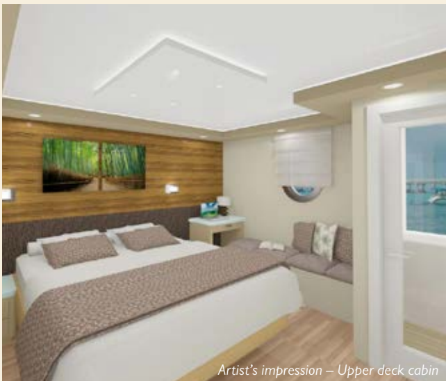
Artist's impression – Upper deck cabin