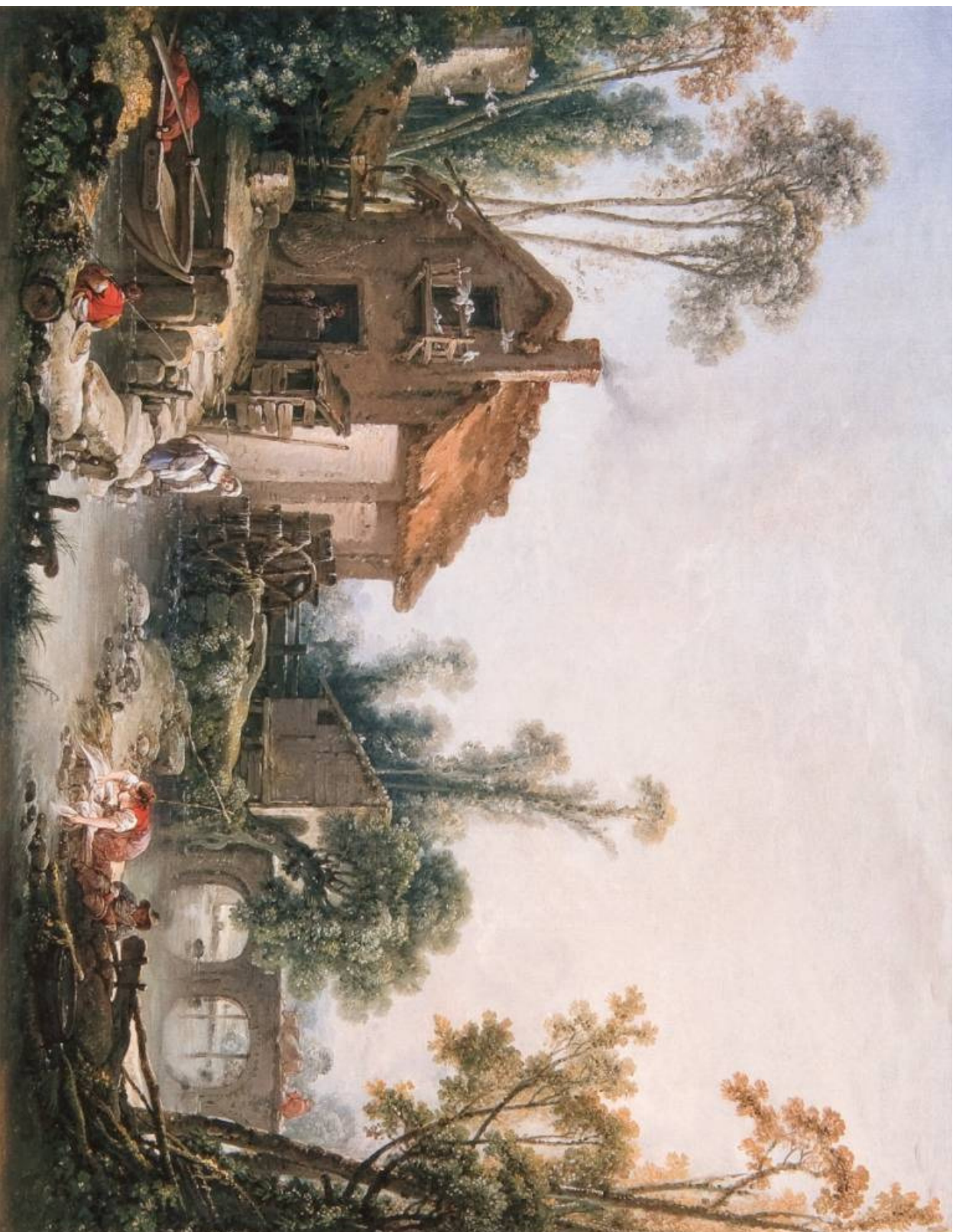
François Boucher, Landscape with a Watermill , 1755, oil on canvas, London, The National Gallery.