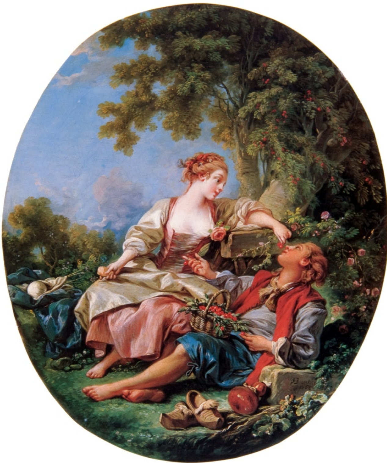
François Boucher, The Clogs , 1768, oil on canvas, Toronto, Art Gallery of Ontario.