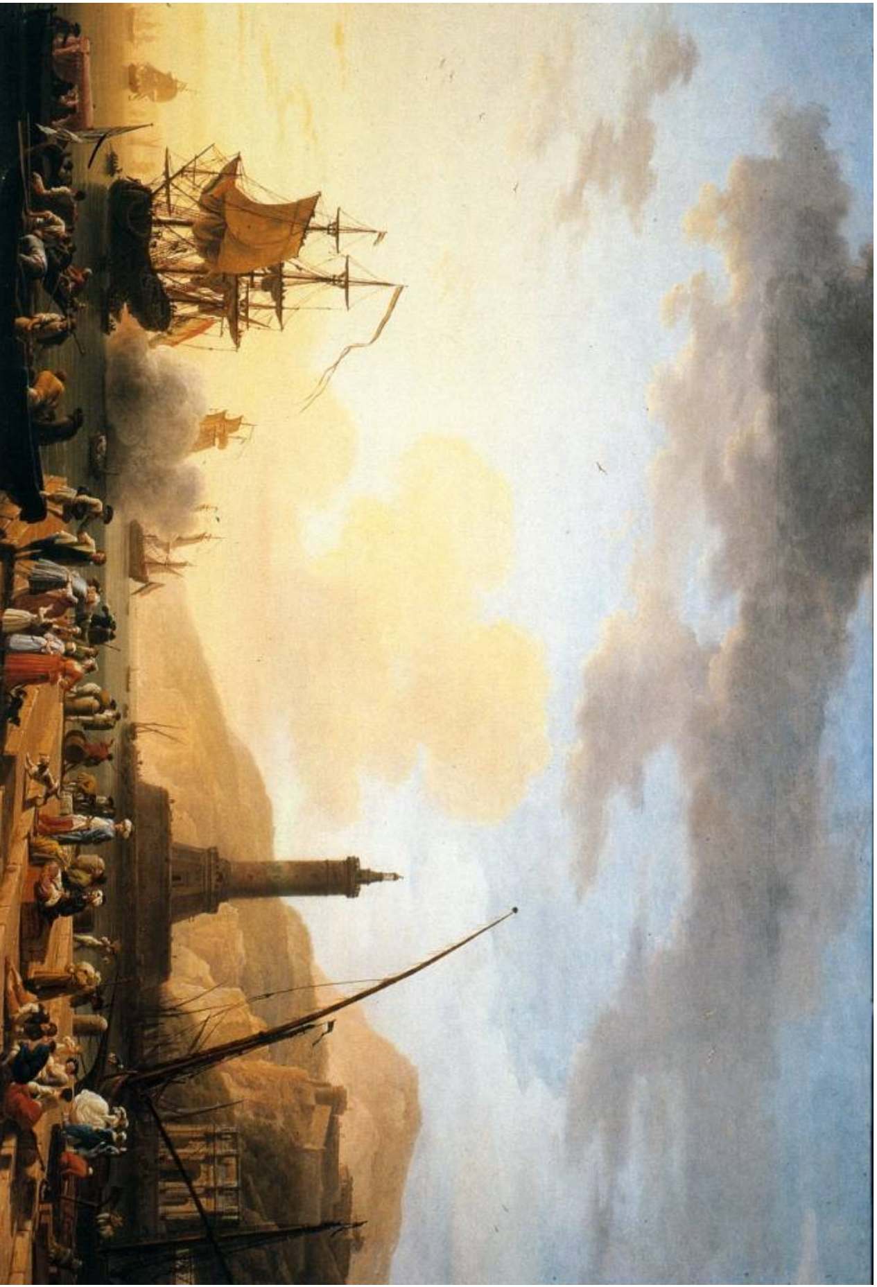
Joseph Vernet, Seaport at Sunset , 1749, oil on canvas, San Diego, Timken Museum of Art.