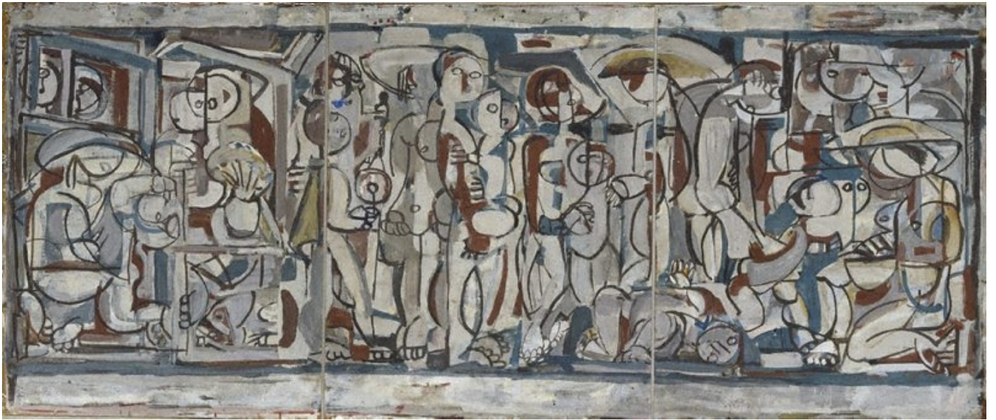
Ian Fairweather 1891-1974, Anak Bayan 1957, AGNSW