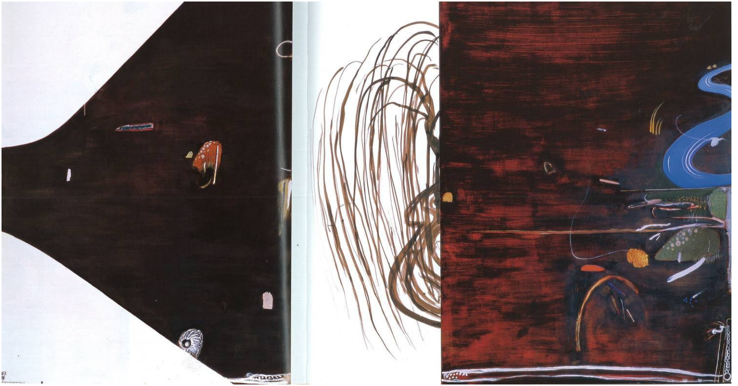
Brett Whiteley 1939-92, Autumn (near Bathurst) - Japanese Autumn 1987-8, private collection