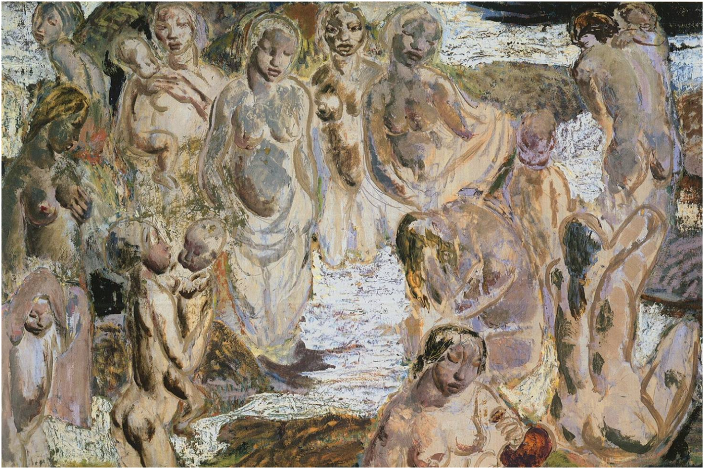
Ian Fairweather 1891-1974, Bathing scene, Bali 1933, Tate, London