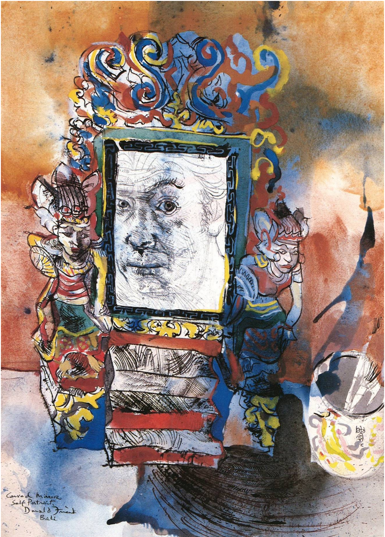
Donald Friend 1915-90, Self portrait in a carved mirror c1972, private collection