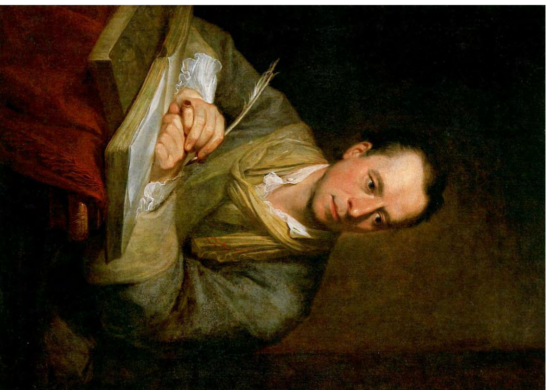
Angelica Kauffmann, Portrait of Winkelmann , 1764, oil on canvas, 97.2 x 71cm, Zürich, Kunsthaus