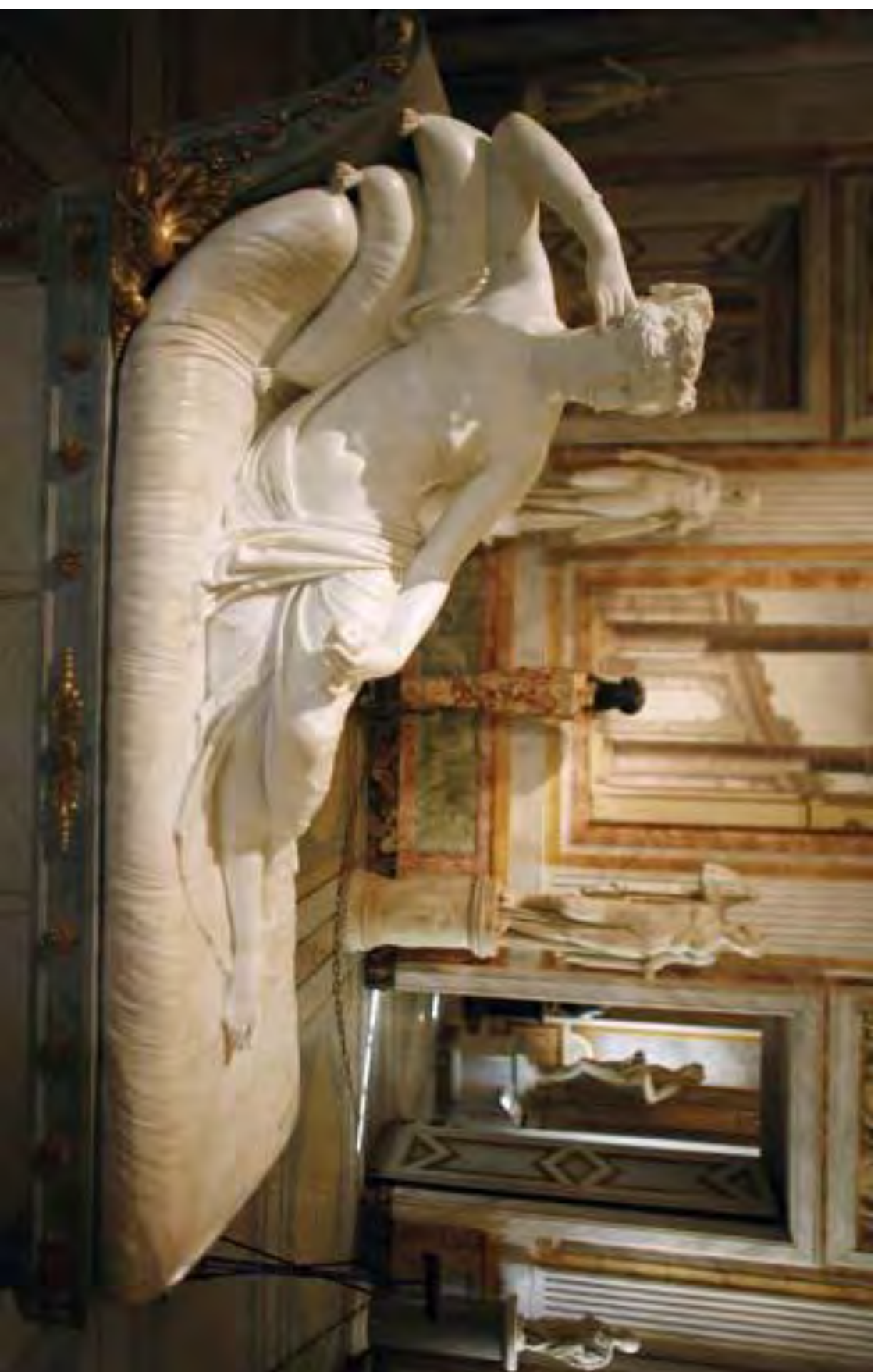
Canova, Paolina Borghese as Venus Victrix , 1804-08, Villa Borghese, Rome