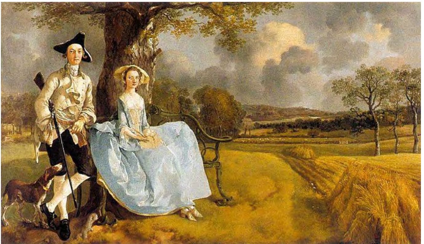
Thomas Gainsborough, Mr and Mrs Andrews , c1750, National Gallery, London