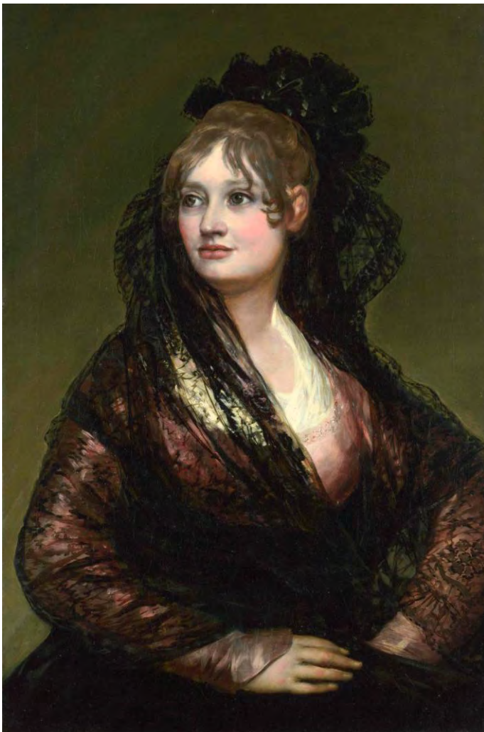
Goya, Dona Isabel Cabos de Porcel , 1805, London NG