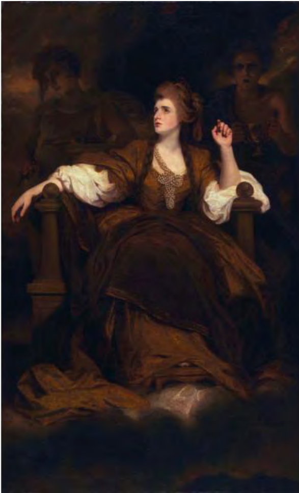
Joshua Reynolds (1723-1792), "Sarah (Kemble) Siddons as the Tragic Muse" c.1783-1784, oil on canvas, The Huntington Library, Art Collections