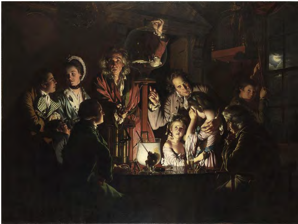
Joseph Wright, Experiment on a Bird in the Air Pump , 1768, 183 x 244 cm