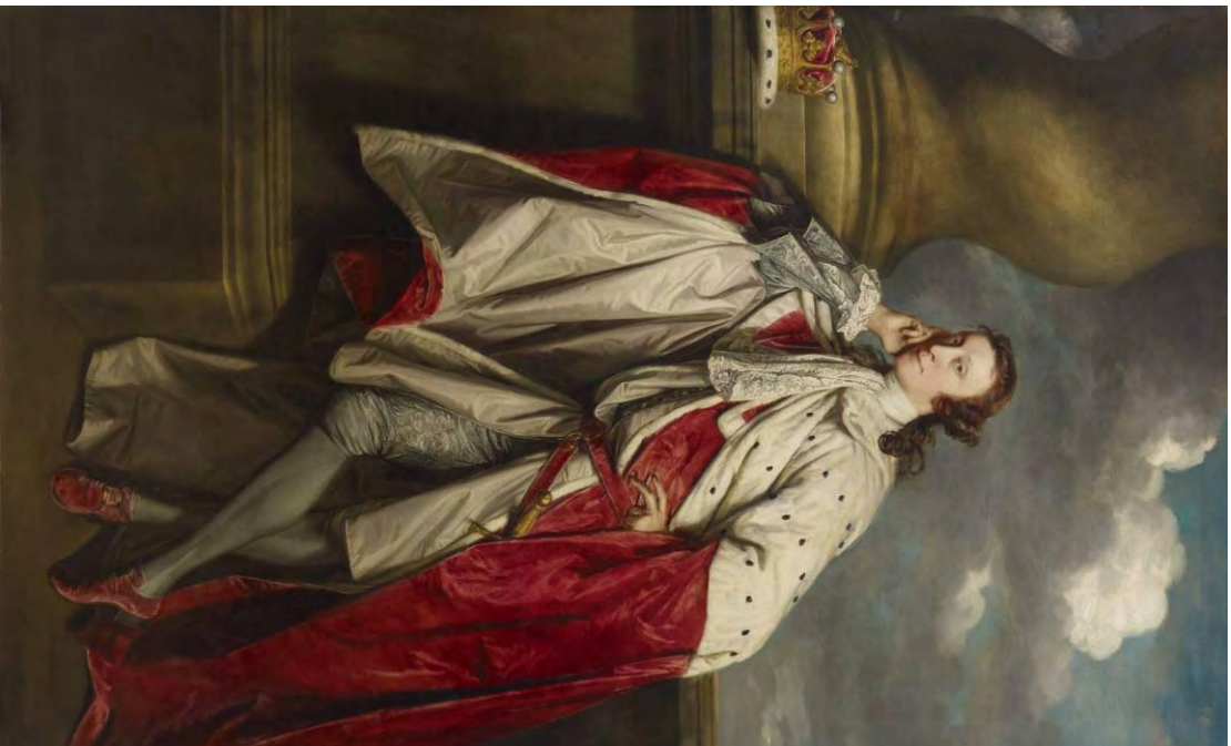
Joshua Reynolds, James Maitland, 7th Earl of Lauderdale , 1759-1761, oil on canvas, stretcher 238.6 x 144.6cm , frame 264.1 x 172.0 x 9.0cm, AGNSW