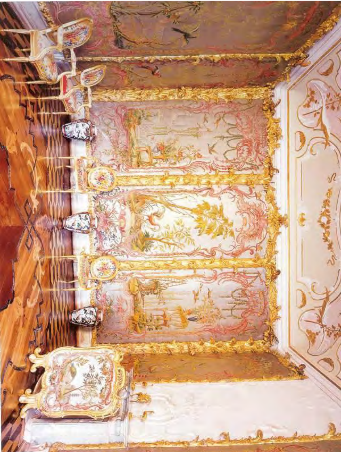
Oranienbaum, Glass Beaded Salon, Russia