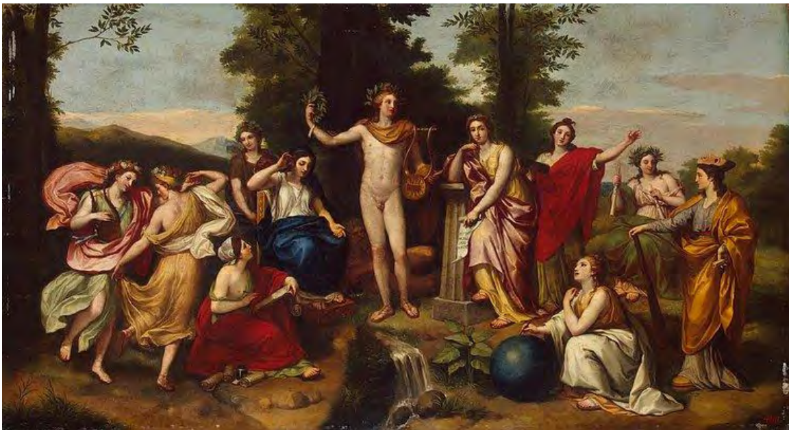
Anton Raphael Mengs, Parnassus , 1761, fresco, Villa Albani, Rome