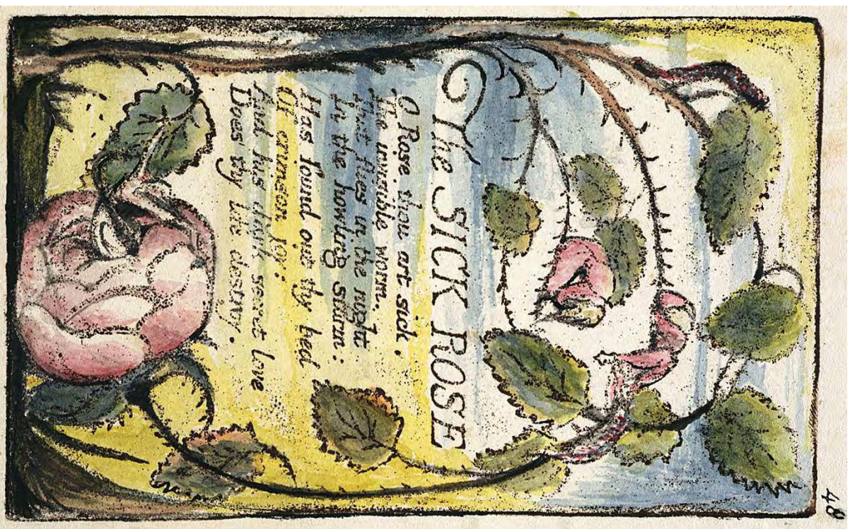
William Blake, "The sick rose", in Songs of Innocence and of Experience , 1826, hand coloured relief etching, The Fitzwilliam Museum, copy AA.