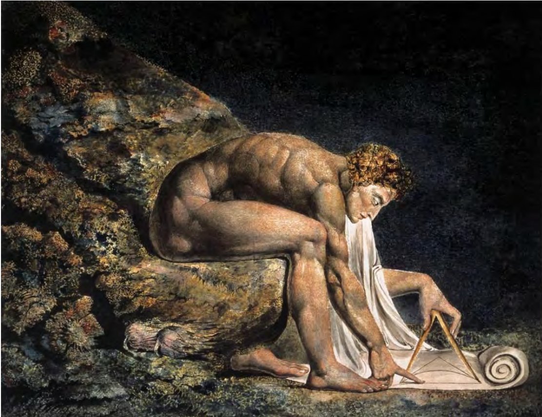
William Blake, Newton , c1795-1805, colour print, ink and watercolour on paper. Tate Britain