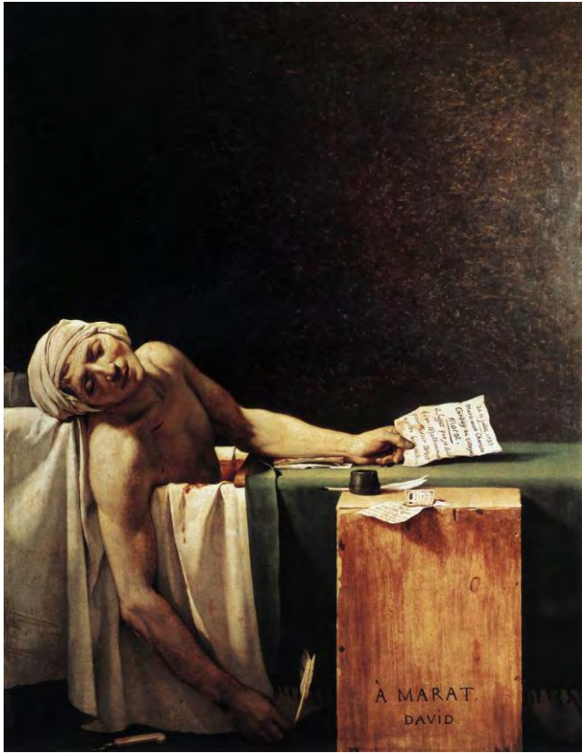
Jacques-Louis David, Marat at his Last Breath (1793, Oil on Canvas, Brussels, Musées Royaux)