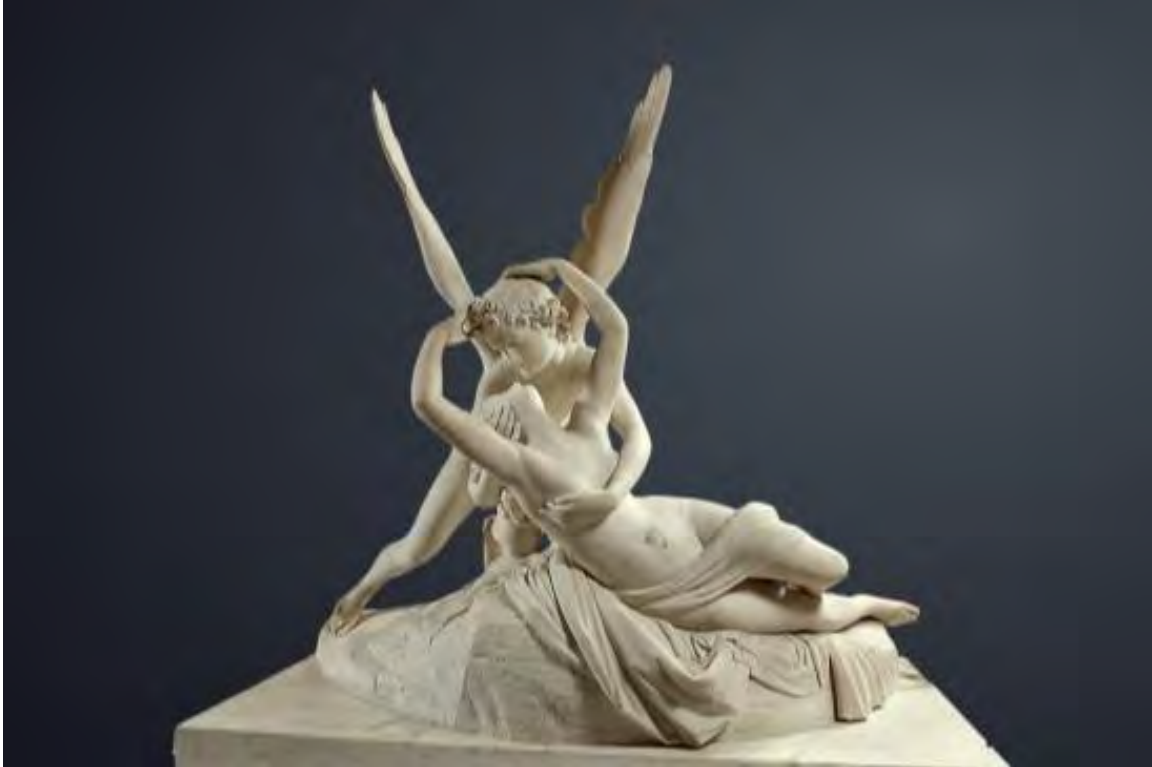
Canova, Psyche revived by Cupid's kiss , c1787-93, The Louvre, Paris