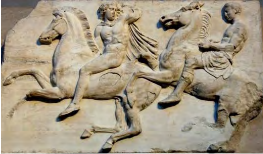
Phidias, Detail of the Ionic Frieze of the Parthenon (Block II from the West Frieze), marble, London, British Museum