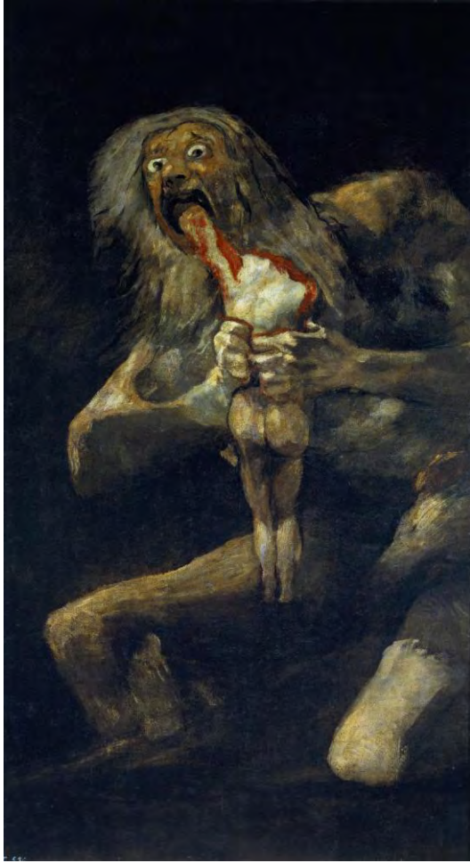
Goya, Saturn Devouring His Children, Oil, 1820-23, Prado