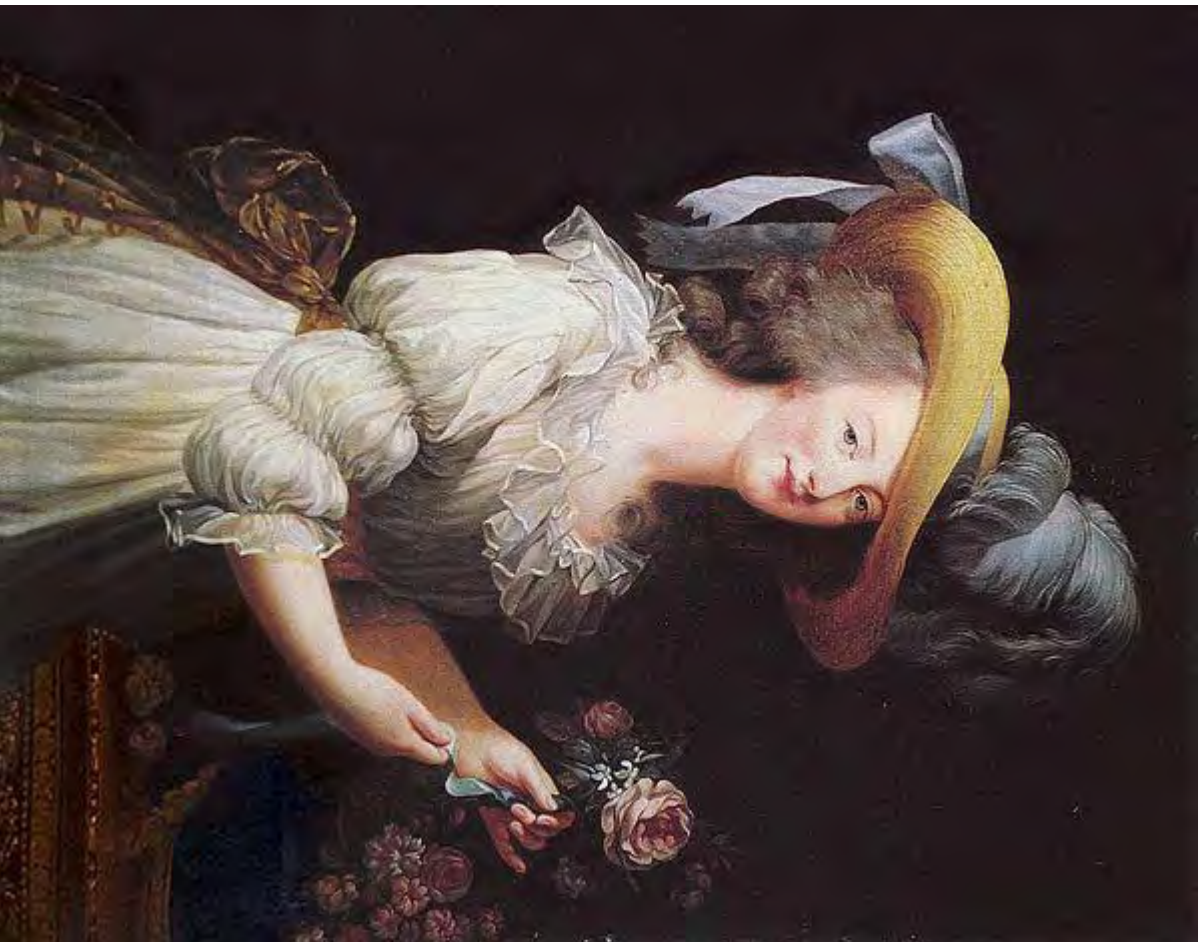
Elisabeth Vigee Le Brun, Marie-Antoinette en Chemise . 1783. Private Collection