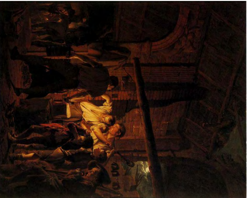
Joseph Wright, Blacksmith's Shop , 1771, 128.3 x 104cm, Yale Center for British Art