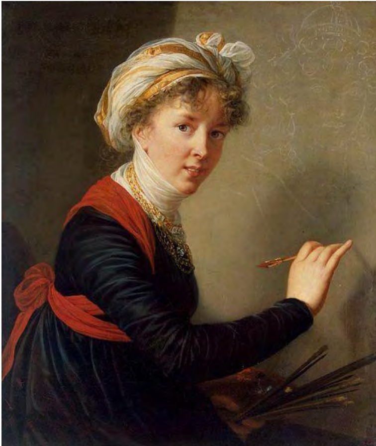
Elisabeth Vigree-LeBrun (1755-1842) Self-Portrait , 1800, o/c Hermitage, St. Petersburg