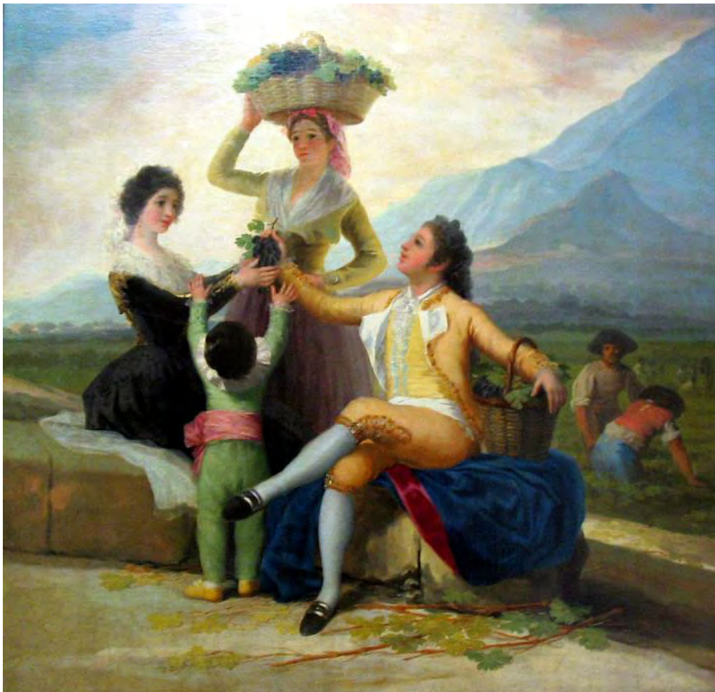
Francisco de Goya y Lucientes (1746-1828) Grape Harvest , 1787, Prado