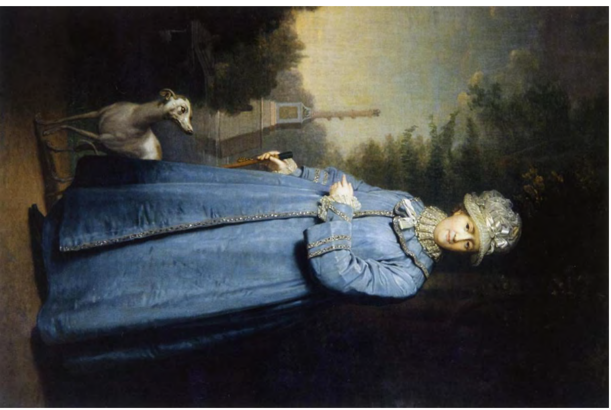
Vladimir Borovikovsky, Catherine the Great walking in the Gardens of Tsarskoe Selo , 1794, The Tretyakov Gallery, Moscow