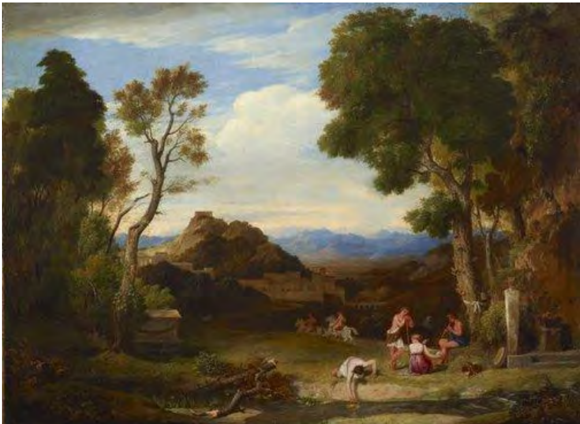
Charles Lock Eastlake, Classical Landscape , c. 1825-30, oil on canvas, 67.3 x 90.3 cm, Sydney, Art Gallery of NSW