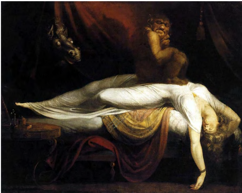
John Henry Fuseli, The Nightmare (1781 version) exh. 1782, Oil on Canvas, Detroit Institute of Arts