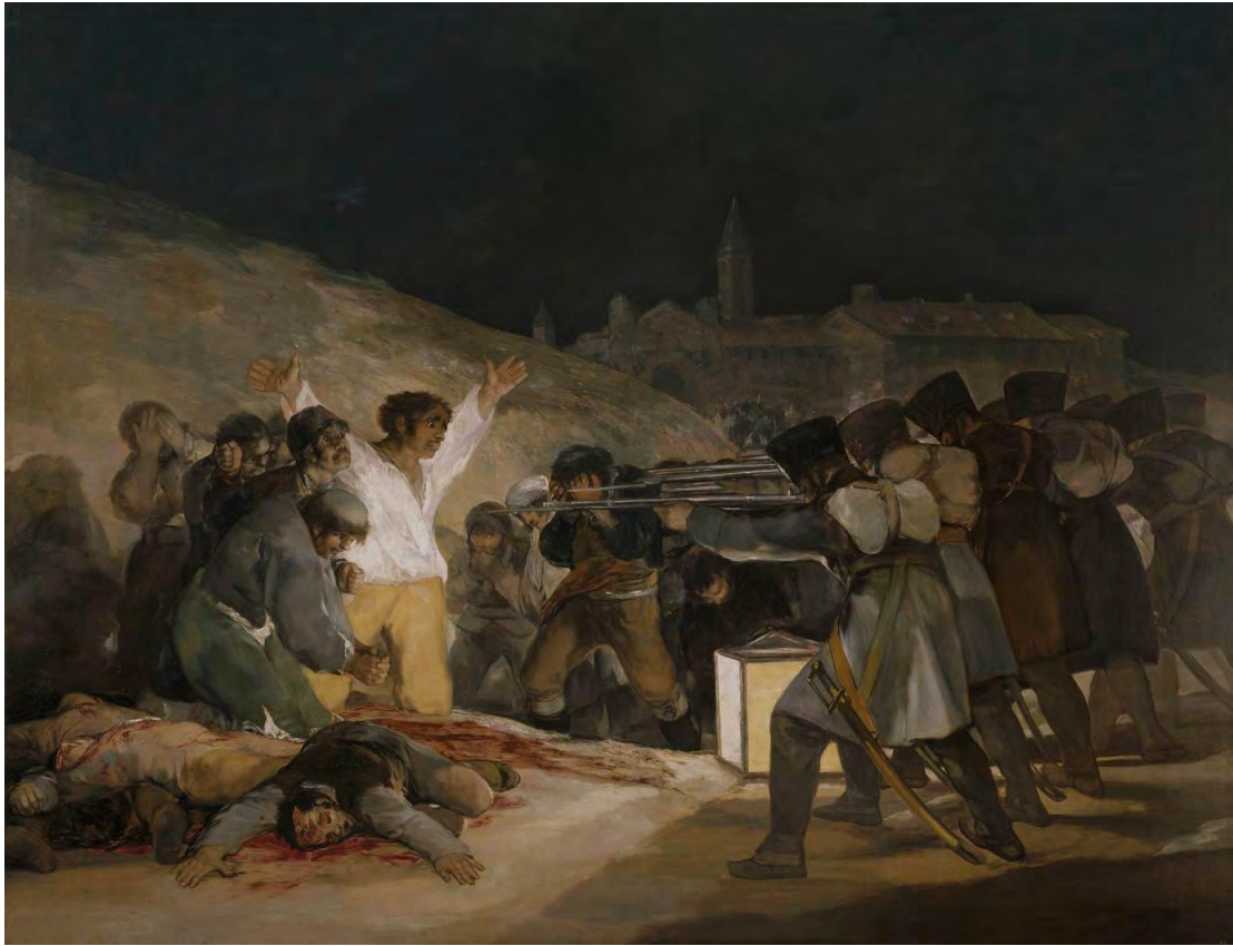
Goya, Third of May, 1808 , c1814, Prado.