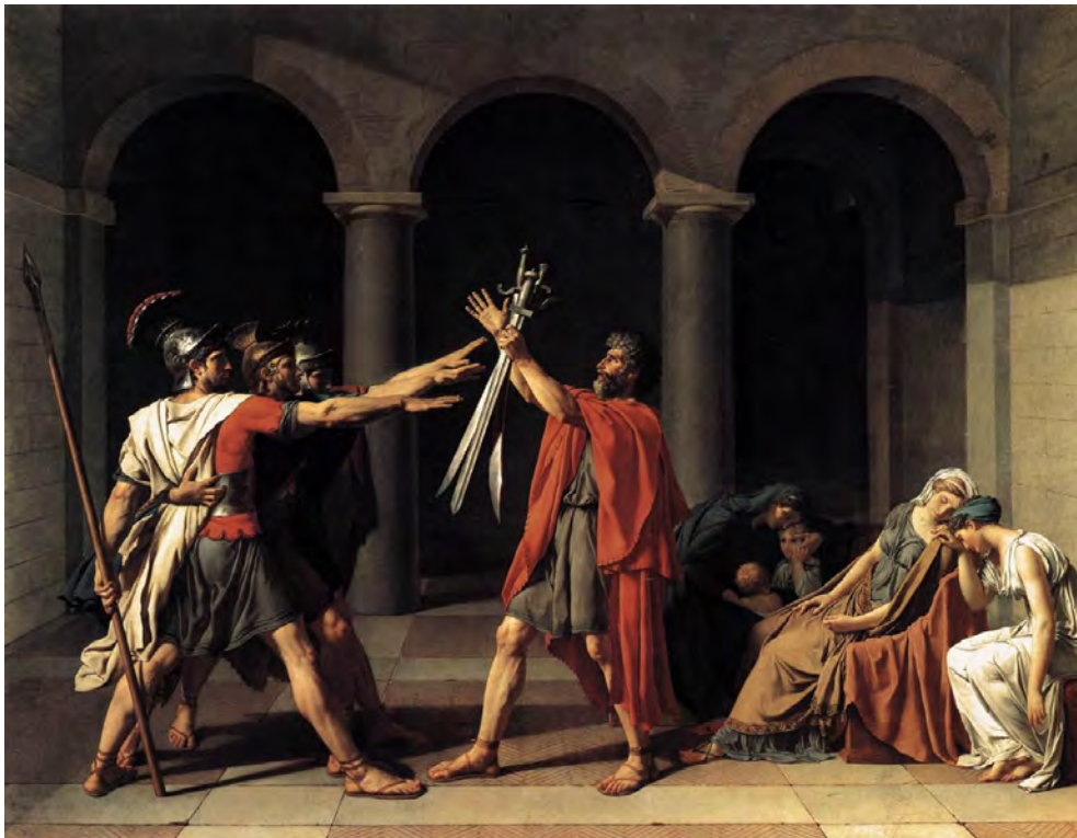
Jacques-Louis David, The Oath of the Horatii , oil on canvas, 1784-5 Paris, Louvre