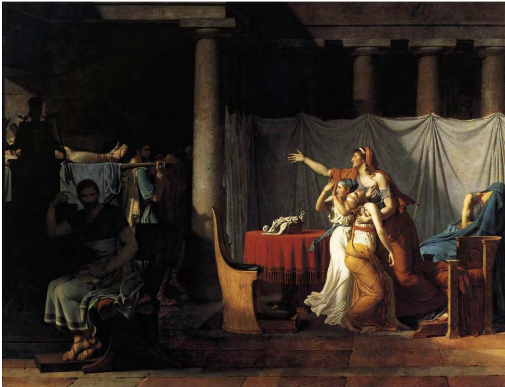
Jacques- Louis David, The Lictors returning to Brutus the Bodies of his dead sons (1789, Oil on Canvas, Paris: Louvre)