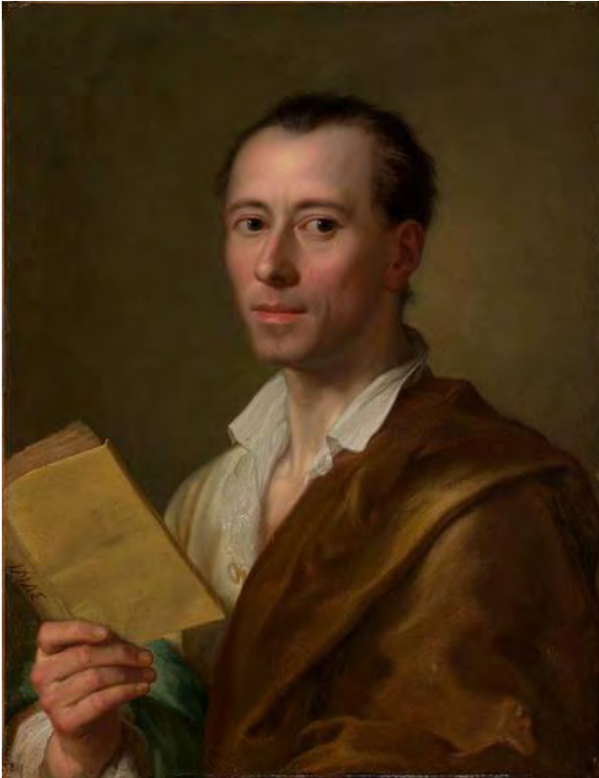
Anton Raphael Mengs, Portrait of Winckelmann , 1777, oil on canvas, 63.5 x 49.2 cm, New York, Metropolitan Museum