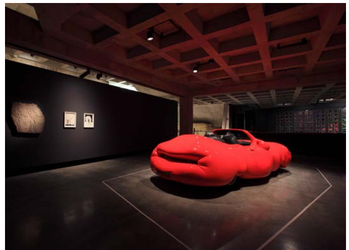
Fat Car by Erwin Wurm