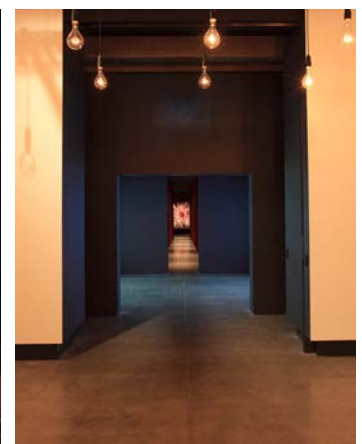
Foreground: Pulse Room by Rafael Lozano-Hemmer Background: Bullet Hole by Mat Collishaw