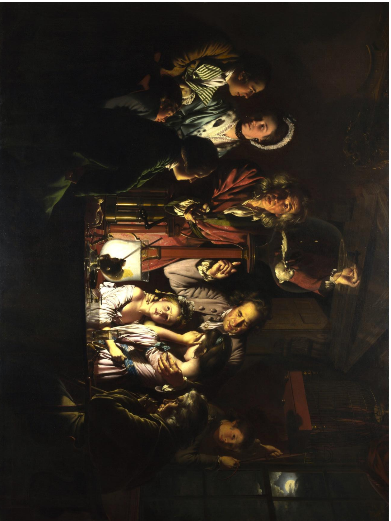
Joseph Wright of Derby, Experiment on a Bird in the Air Pump , 1768, 183 x 244 cm, London, National Gallery