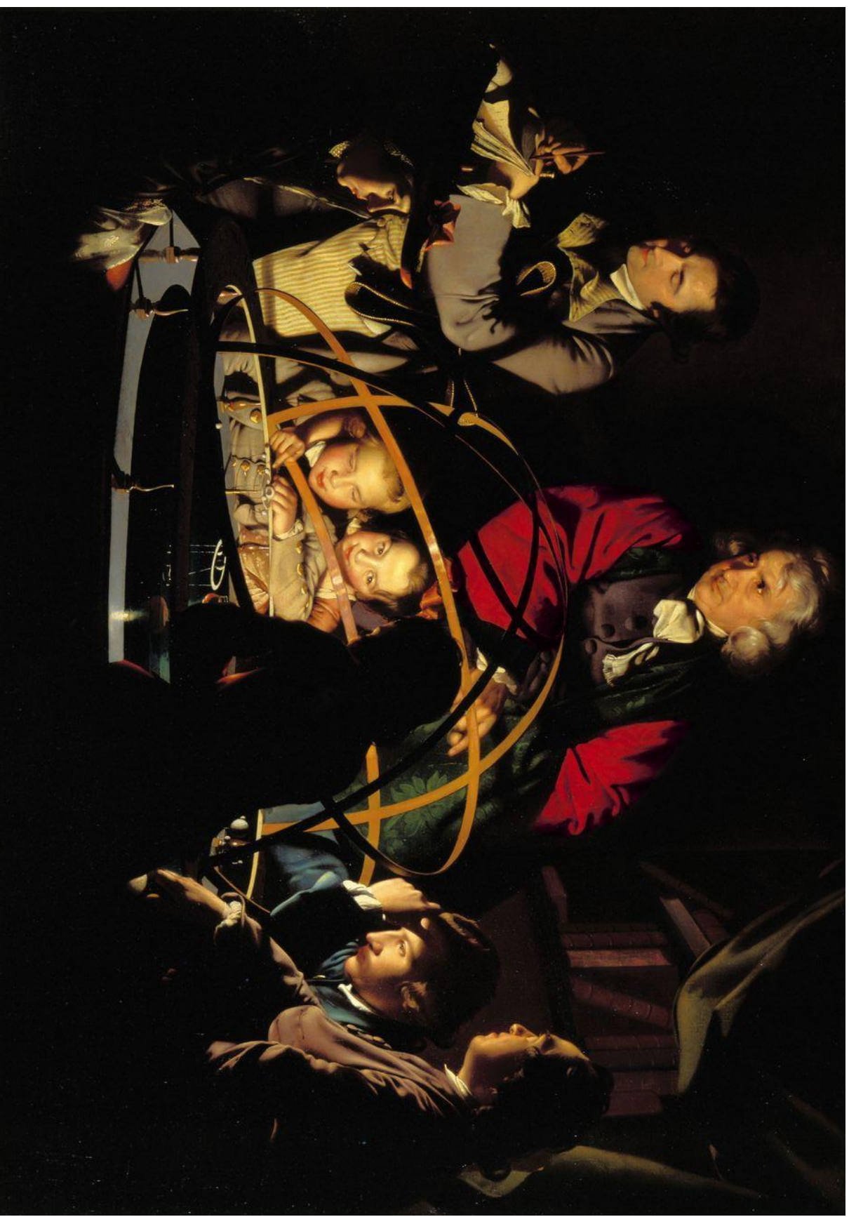
Joseph Wright, A Philosopher Giving that Lecture on the Orrery, in which a lamp is put in place of the sun , 1766, oil on canvas, 147 x 203 cm, Derby: Derby Museum and Art Gallery