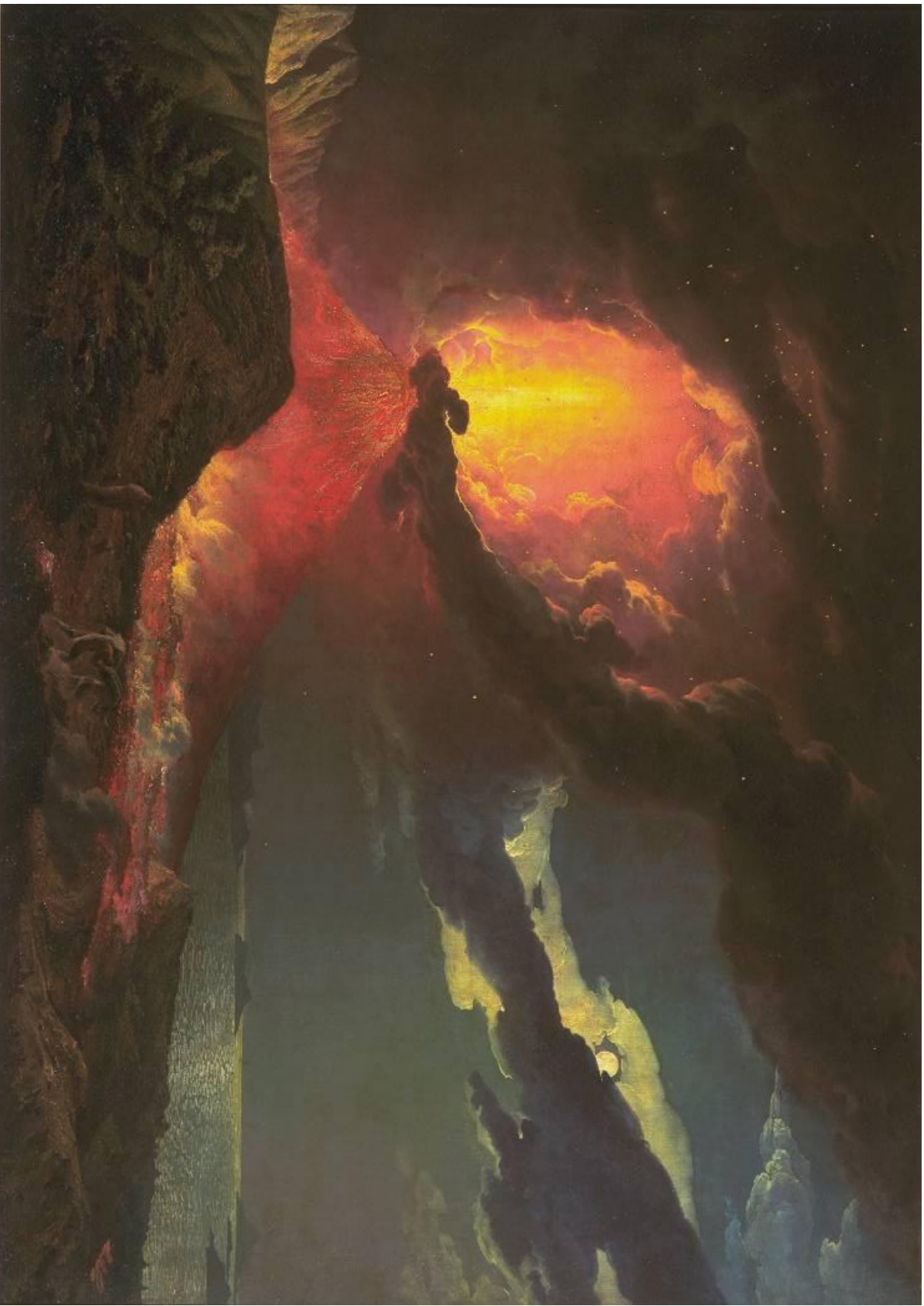
Joseph Wright, Vesuvius in Eruption, with a View over the Islands in the Bay of Naples , c. 1776-80, Oil paint on canvas, 122 x 176.4 cm, Tate