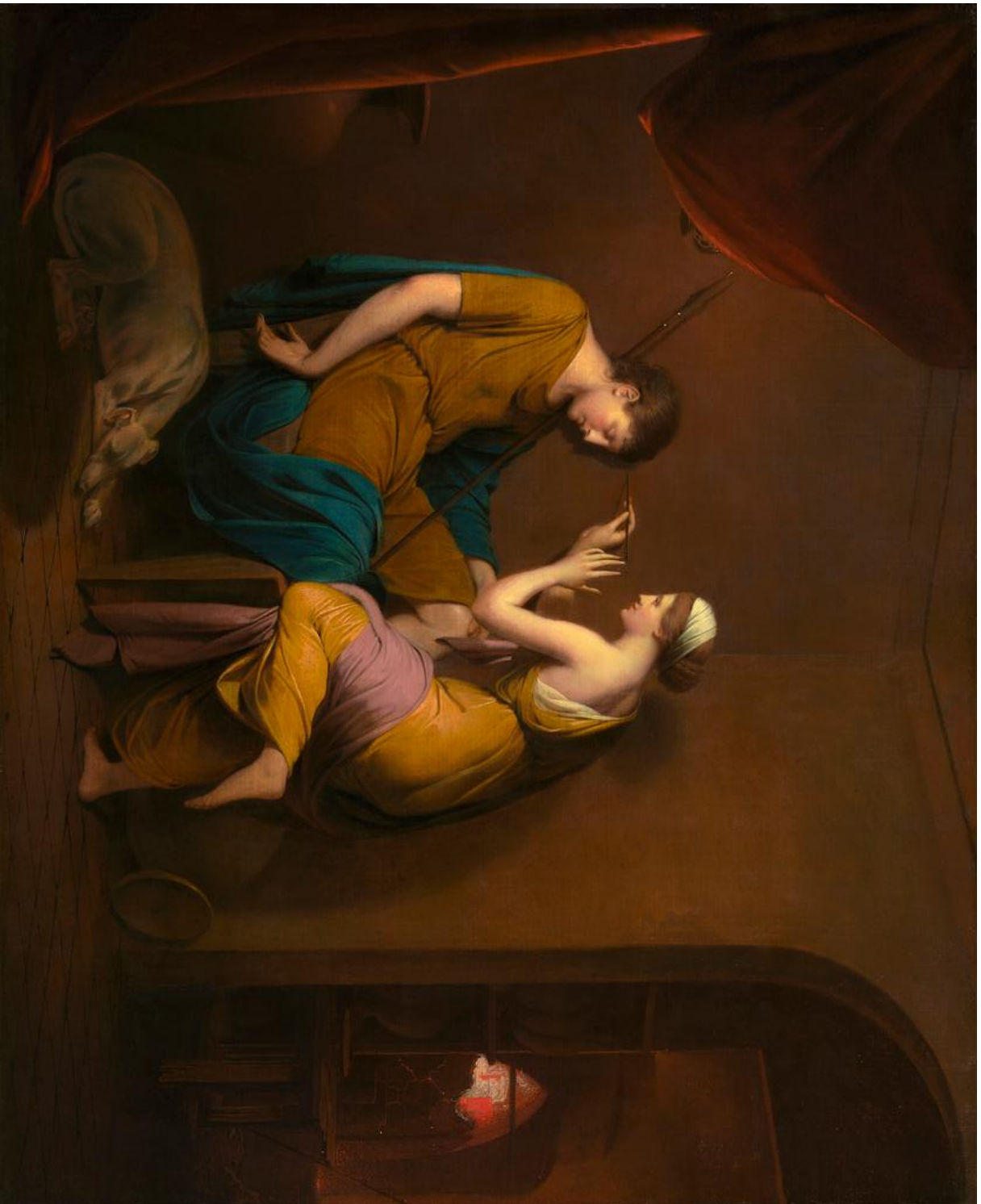
Joseph Wright, The Corinthian Maid , 1782-85, oil on canvas, 106.3 x 130.8 cm, National Gallery of Art, Washington