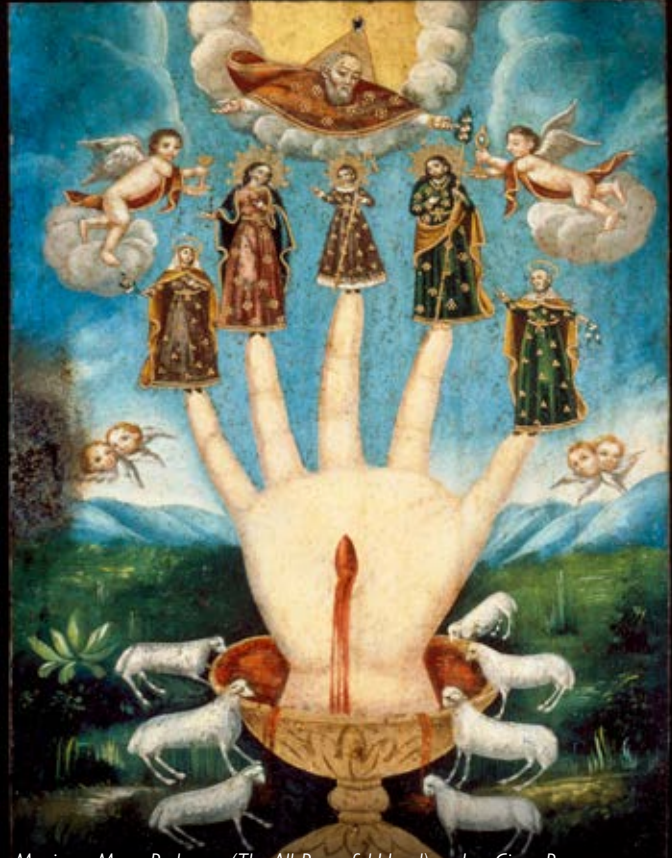
Mexican. Mano Poderosa (The All-Powerful Hand), or Las Cinco Personas (The Five Persons), 19th century