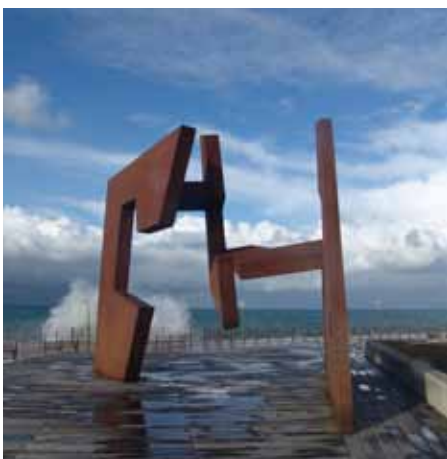
Empty Structure by Jorge Oteiza at San Sebastian

You can find a copy of the full terms & conditions attached to the Renaissance Tours booking form. They can also be found on our website at: www.renaissancetours.com.au or we would be happy to post you a copy on request.