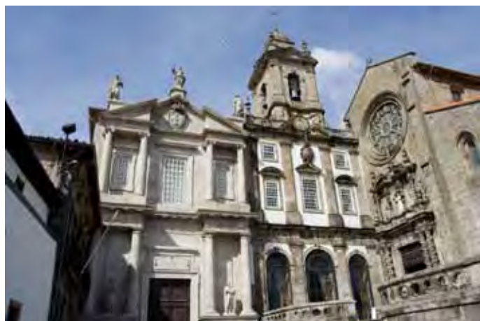
São Francisco Church in Porto

Tour arrangements conclude after breakfast. If travelling on the suggested flights, transfer to the airport for an evening flight on Air France to Singapore via Paris, connecting with overnight flights to Australia on Qantas. (B)