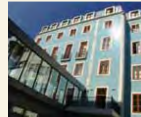
Hotel Eurostars das Artes Porto