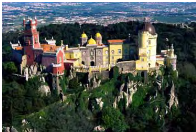
Palácio da Pena

After lunch, visit the celebrated Museu Calouste Gulbenkian , to view its impressive and wide ranging art collections, spanning Egyptian and classical antiquities, European old and modern masters, as well as Oriental and Islamic treasures. (BL)