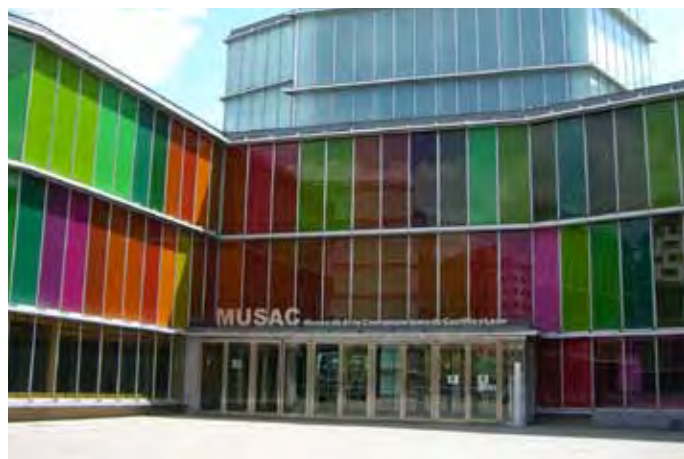
Contemporary Art Museum of Castilla and León (MUSAC)

Santiago de Compostela's rich and renowned heritage has been increased in the last two decades with outstanding