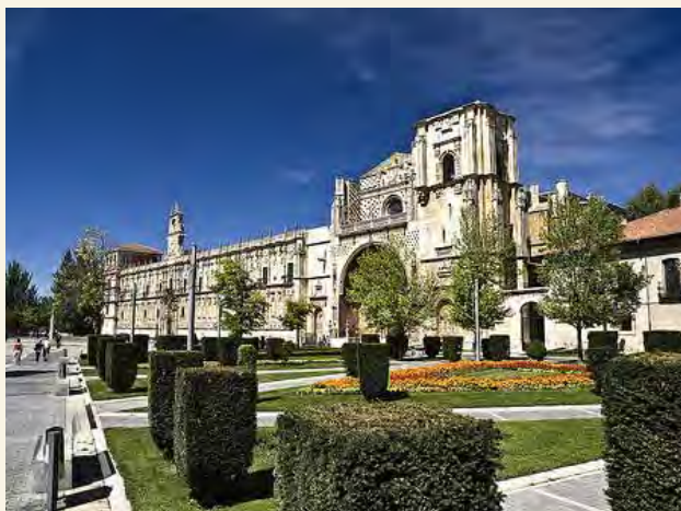
Parador de Leon 'Hostal San Marcos'

The hostel which originated as a Royal Hospital in 1499 gave lodging and shelter to the numerous pilgrims making their way to Santiago. It continues this age old practice today and is considered to be the oldest hotel in the world.