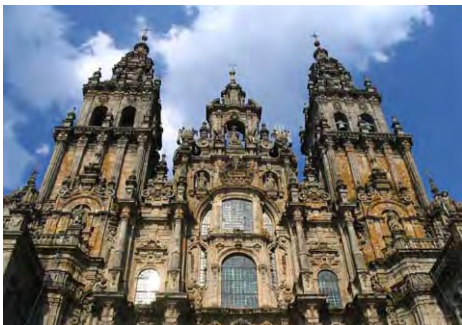
Santiago de Compostela Cathedral

The tour is not only designed to incorporate visits to important sites of great art and architecture, the journey itself will play a key part. Encounter landscapes of dramatic beauty and variety, from the Atlantic coastal escarpments and rivers of Portugal, to the remote plateaus and plains of Northern Spain. This will be a journey to savour slowly and enjoy fully.