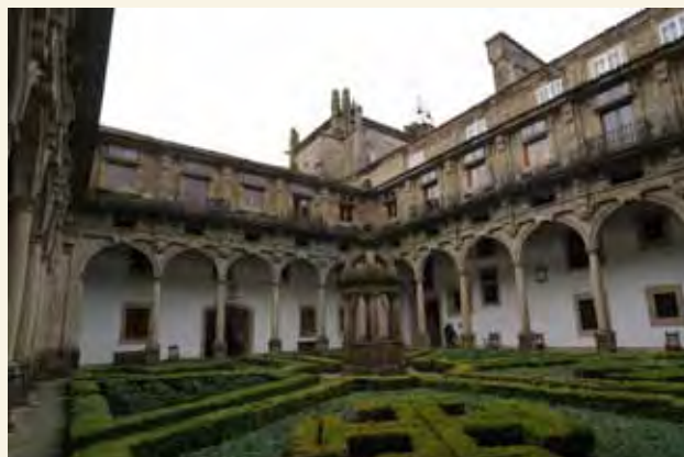
Parador Santiago de Compostela 'Hostal Dos Reis Catolicos'

Paradores are hotels housed in historic buildings such as Castles, Palaces, Fortresses, Convents and Monasteries offering a unique experience.