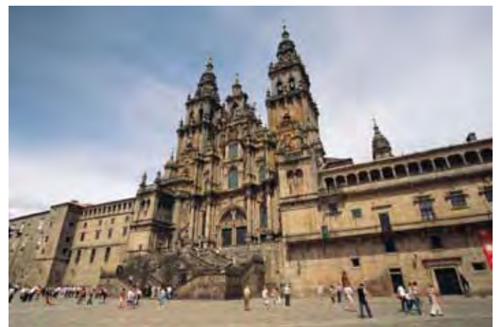
Cathedral in Santiago de Compostela

Continue to Vila Nova de Gaia ('Gaia') across the Douro river from Porto with a shared history of port-wine making. No visit to Porto would be complete without a visit to the terracotta-topped Port Wine warehouses for a tour and tasting. (BD)