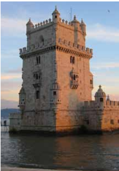
Torre de Belém in Lisbon