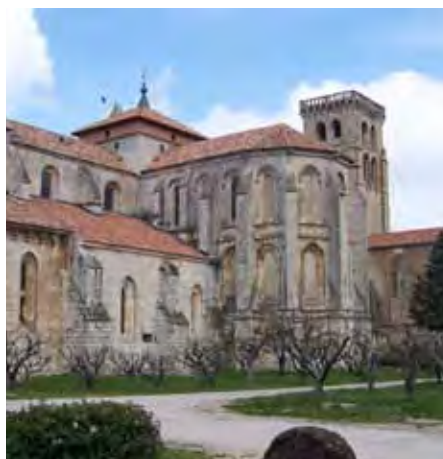
Las Huelgas Convent at Burgos