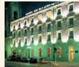
NH Palacio de Merced Burgos