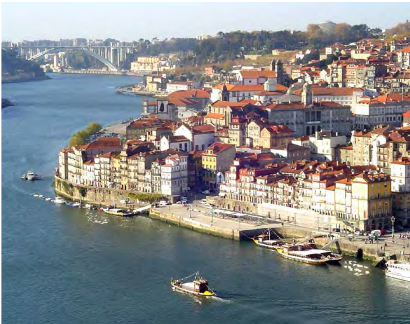
Front Cover: Guggenheim Museum Bilbao Back Cover: Ribeira District in Porto

TO BOOK PORTUGAL & NORTHERN SPAIN: FROM LISBON TO BILBAO CALL RENAISSANCE TOURS ON 1300 727 095 EMAIL INFO@RENAISSANCETOURS.COM.AU