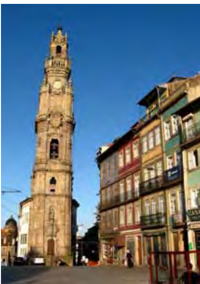
Nicolau Nasoni's Clerigos Tower in Porto