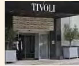
Hotel Tivoli Jardim Lisbon